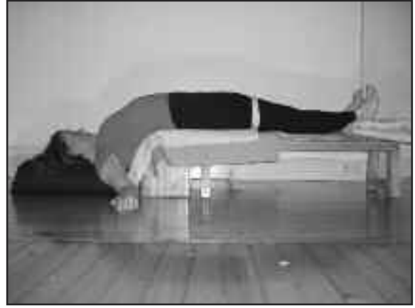
Setu Bandha on a bench