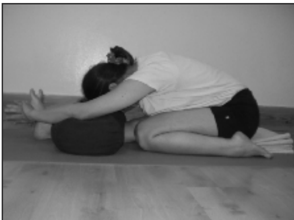
Triaṅḡ Mukhaikapāda Paśchimottānāsana