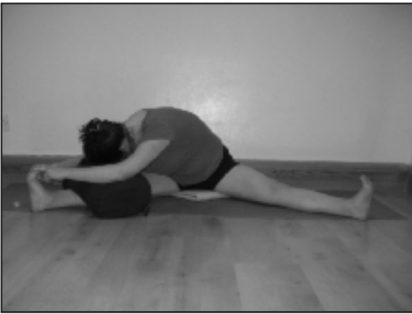
Pārśva Upaviṣṭha Koṇāsana