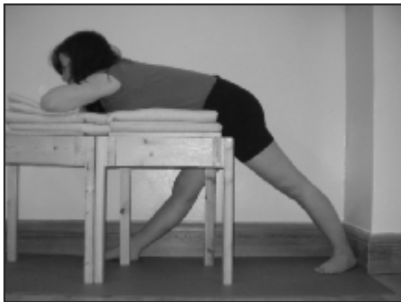
Pārsvottānāsana Head Up