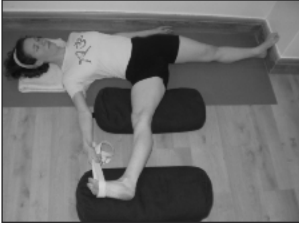
Supta Pādānguṣṭhāsana II