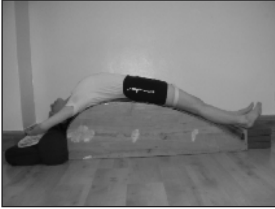
Viparīta Daṇḍāsana on a bench