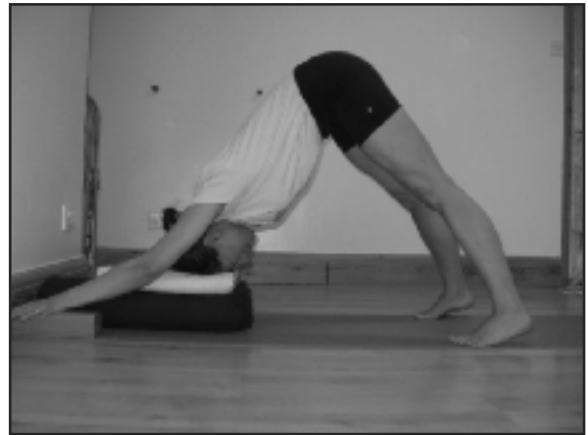
Adho Mukha Śvānāsana