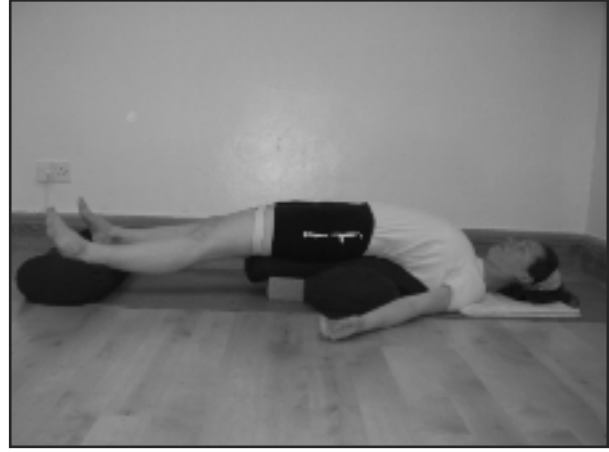
Cross bolster Setubandha

Now, after supine āsana -s one should do forward extensions ( Paśchima Pratana Sthiti ). The āsana -s like Adho Mukha Virāsana , Adho Mukha Svastikāsana , Adho Mukha Baddha Koṇāsana , Jānu Śīrṣāsana , Triṅg Mukhaikapāda Paśchimottānāsana , Ardha Padma Paśchimottānāsana , Marīchyāsana , Adho Mukha Upaviṣṭha Koṇāsana , Pārśva Upaviṣṭha Koṇāsana , and Paśchimottānāsana are the main āsana -s that come under this category. In these postures women are given bolsters so that they rest their foreheads on the bolster. In a usual practice, if you do not use the bolster, you want to extend your body forward and the forehead rests on the shinbone, but here a woman has to respect her energy level, her body state and so on.