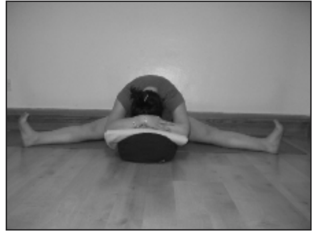
Adho Mukha Upaviṣṭha Koṇāsana