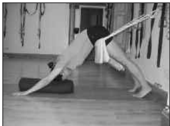
Adho Mukha Śvānāsana on a rope