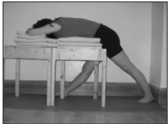
Pārsvottānāsana Head Down