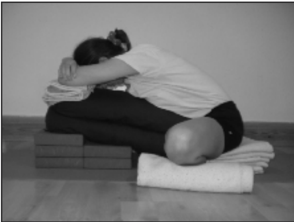
Adho Mukha Baddha Koṅāsana