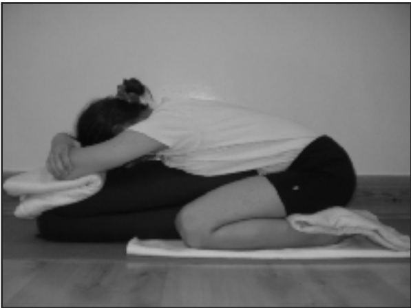
Adho Mukha Virāsana