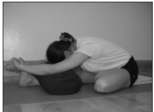
Ardha Padma Paśchimottānāsana