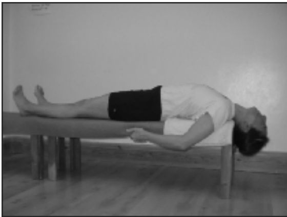
Bench neck curvature